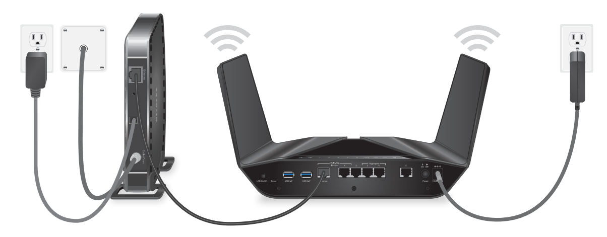
Figure 6. Cable your router

Power on your router and connect it to a modem.