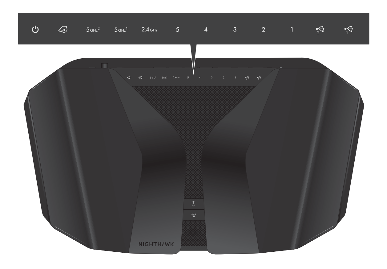
Figure 2. Top view

The status LEDs and two buttons are located on the top panel of the router.