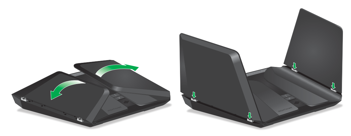
Figure 4. Position the antennas

Before you install your router, extend the antennas as shown in the following figure.