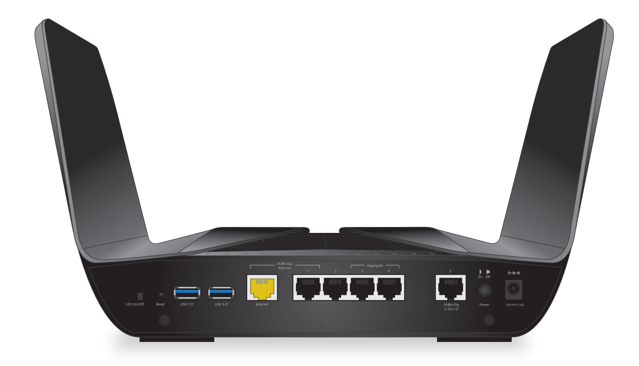
Figure 3. Rear panel

The following figure shows the rear panel connectors and buttons.