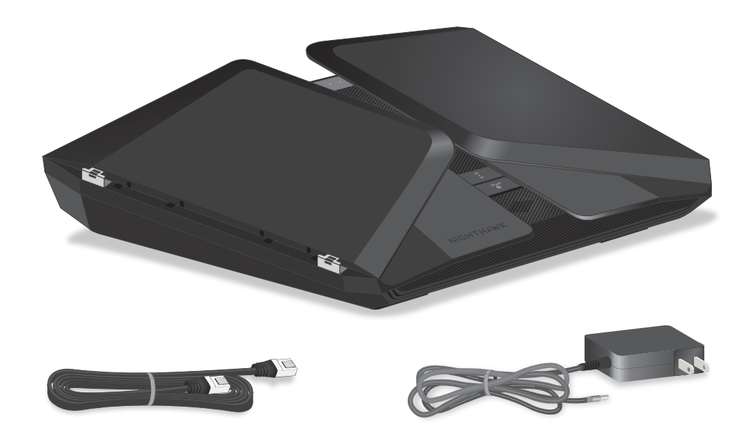
Figure 1. Package contents

Your package contains the router, the power adapter, and an Ethernet cable.