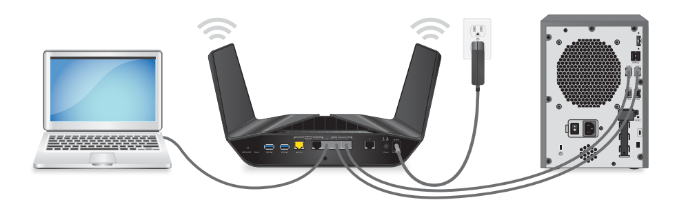
Figure 7. Ethernet port aggregation

WARNING: To avoid causing broadcast looping, which can shut down your network, do not connect an unmanaged switch to Ethernet ports 3 and 4 on your router.